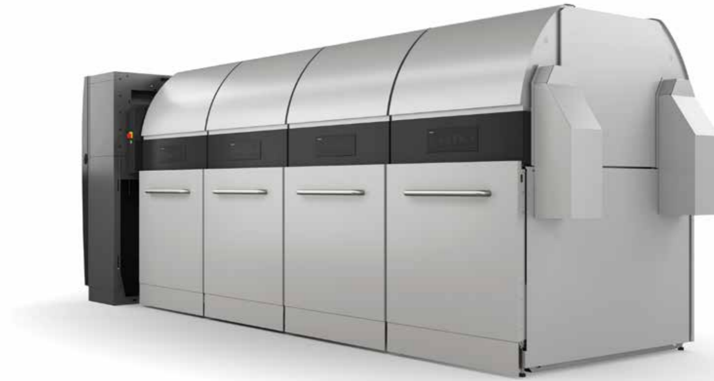
TOMRA T9 with MultiPac

Each T9 MultiPac system is crafted to fit the needs of your customers and your store. Accept any type of recyclables including refillables and crates. Choose from a wide selection of cabinet configurations and end-of-lane kits as your volume and mix of recyclables require.