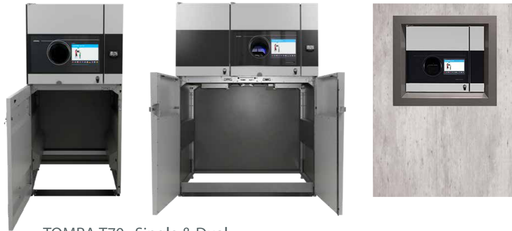
TOMRA T70 Single & Dual

Configure su T70 simple o doble con acceso frontal o trasero, o incluso instálelo en la pared, para obtener una solución de diseño que funcione para sus clientes, su espacio y sus empleados.